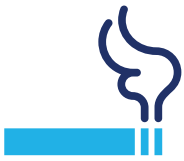
Cigarette & Cigar Smoke