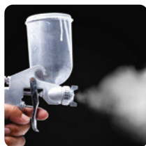
Decomposes volatile organic compounds (VOCs) and other organic compounds